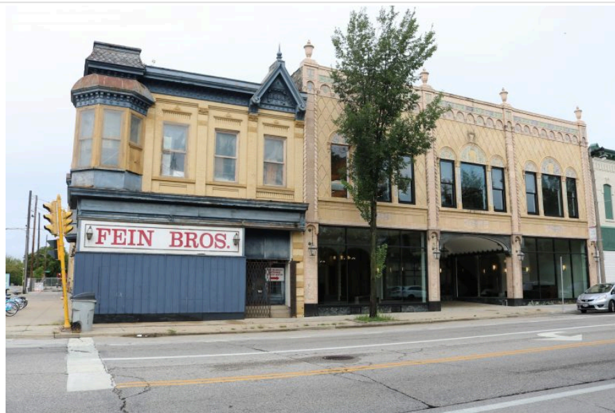
Site of Dohmen Company Foundation headquarters in Bronzeville.

It's been one year since Dohmen Company Foundation announced a commitment to invest $60 million for healthy eating initiatives across the country, adding its efforts to the White House Challenge to End Hunger and Build Healthy Communities.